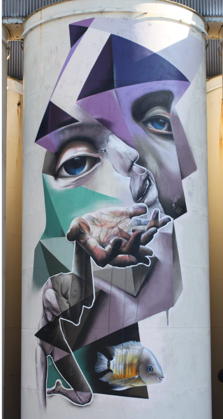
Title: Have mercy Technique: Spray paint on metal silo Location: Den Bosch | Netherlands Size: 8x20 meters Year: 2016