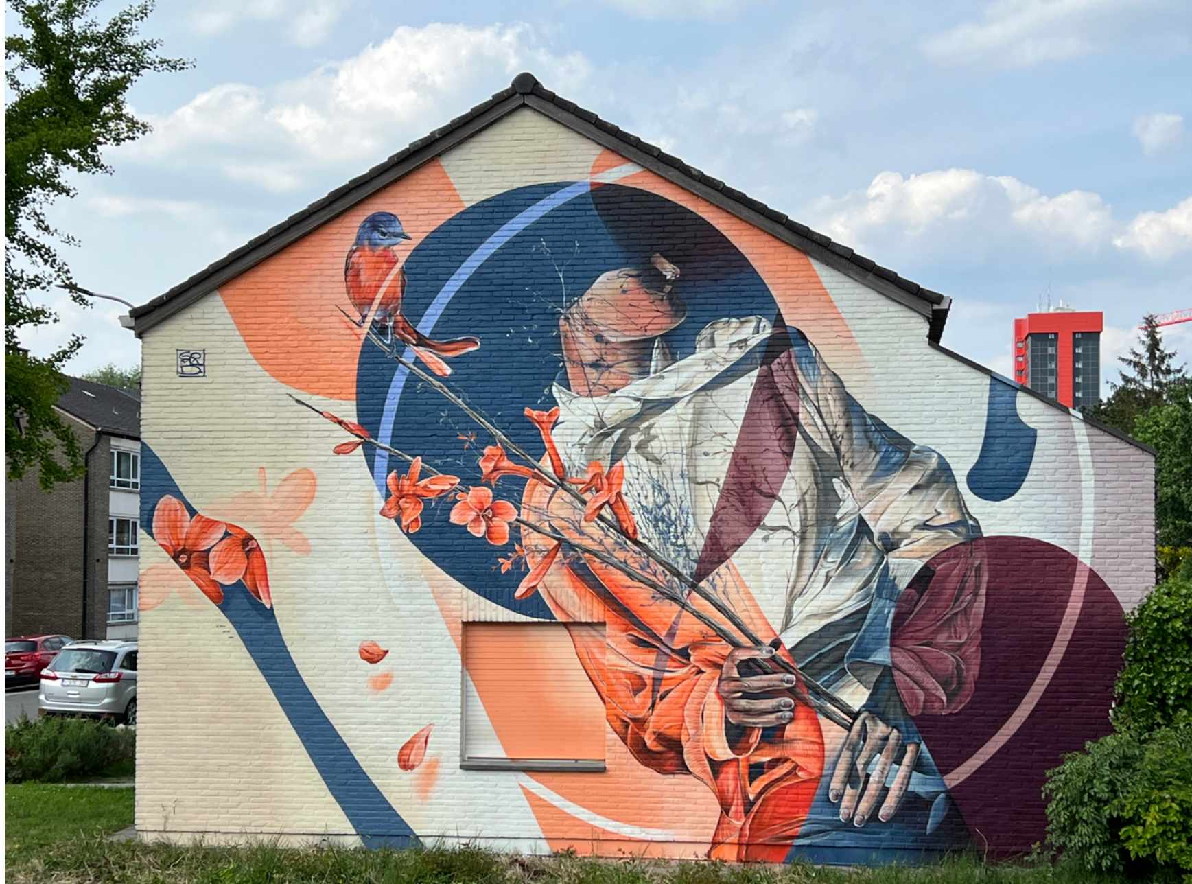
Title: Moeder Natuur Technique: Spray paint on wall Size: 10x8 m Location: Ghent | Belgium Year: 2022