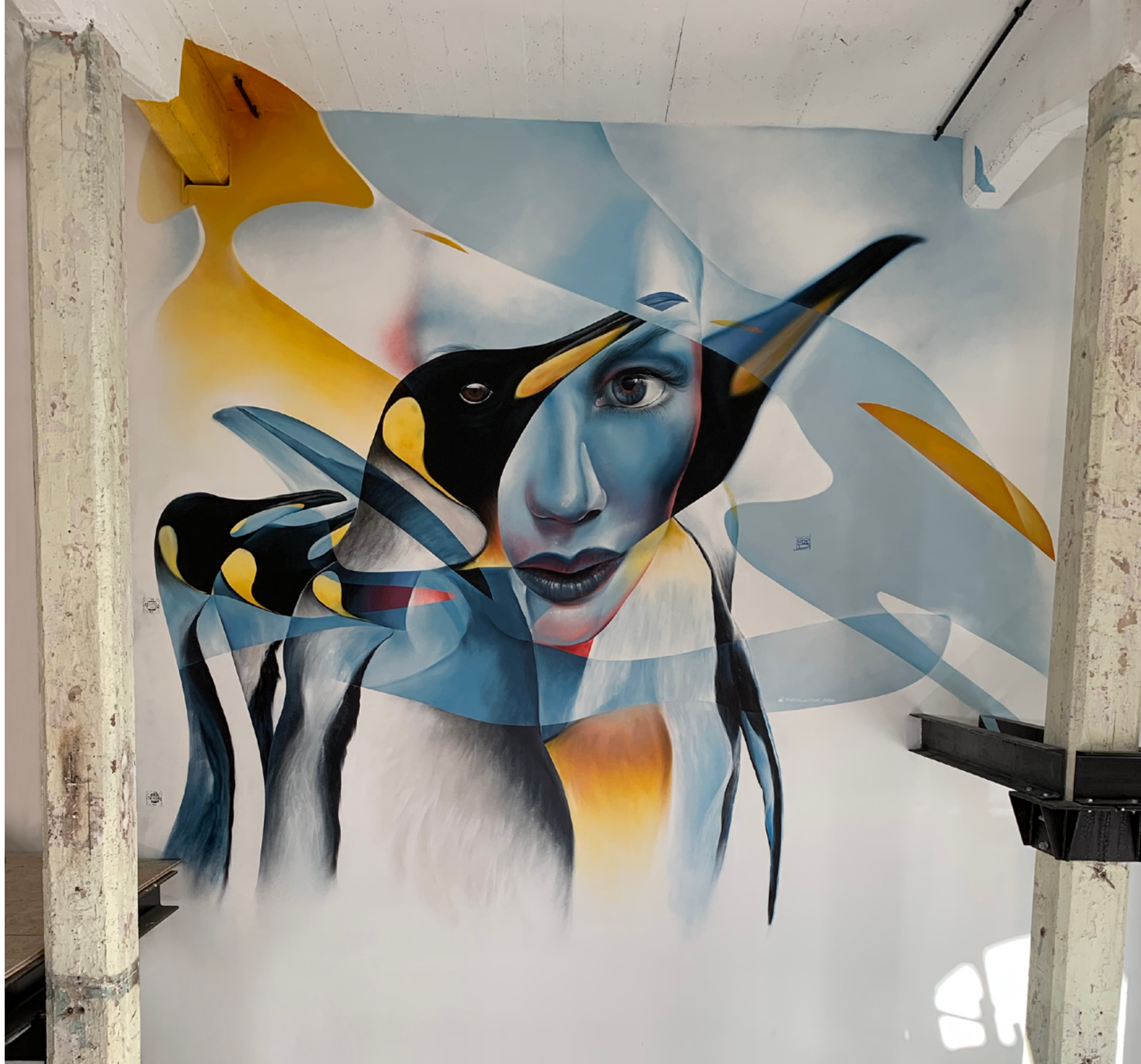
Title: Icy Eyes Technique: Spray paint on wall Size: 4x4 m Location: Tongeren | Belgium Year: 2019