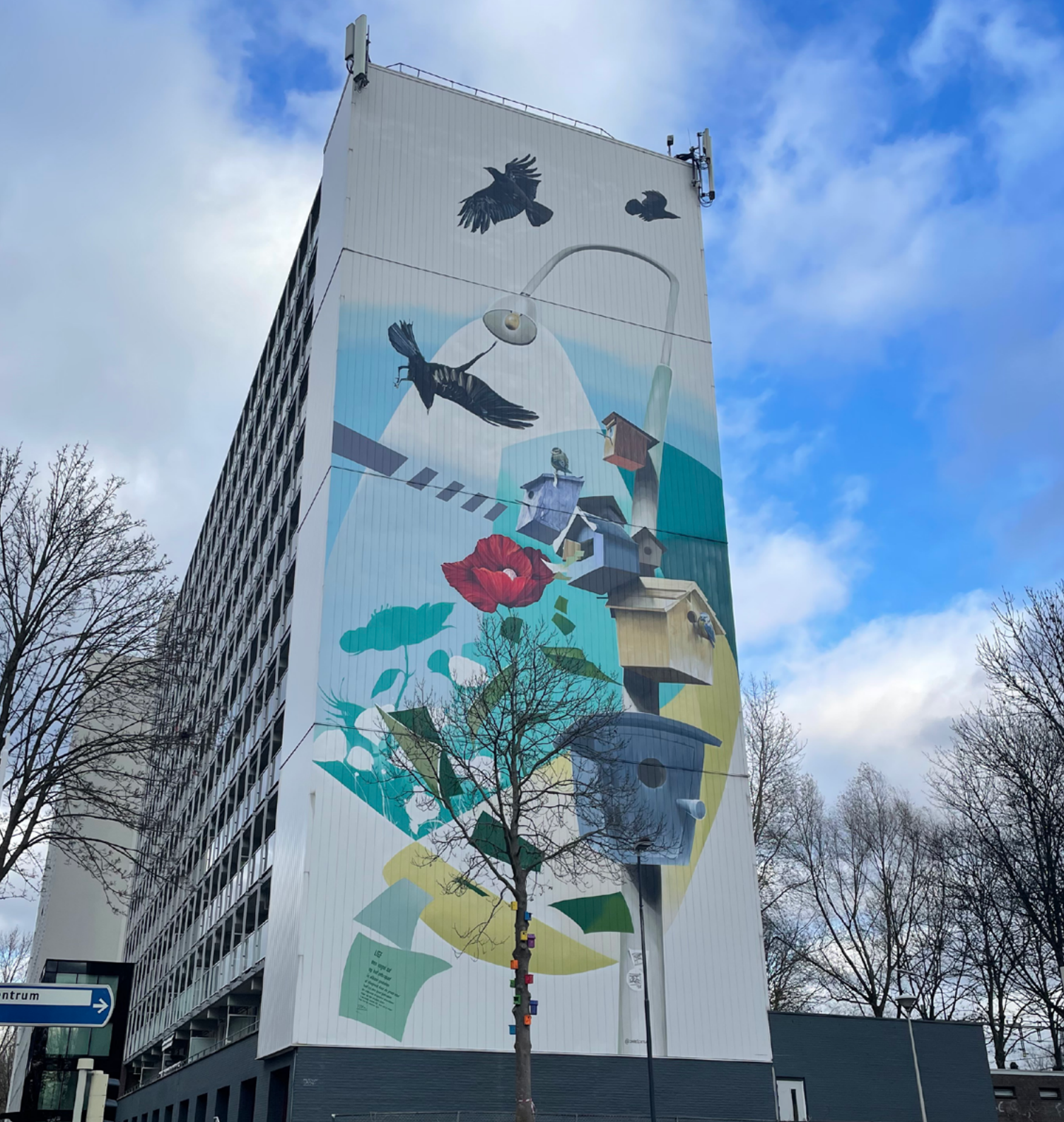
Title: Lief (Dutch for 'sweet') Technique: Spray paint on wall Size: 40x15 m Location: Sittard | Netherlands Year: 2021