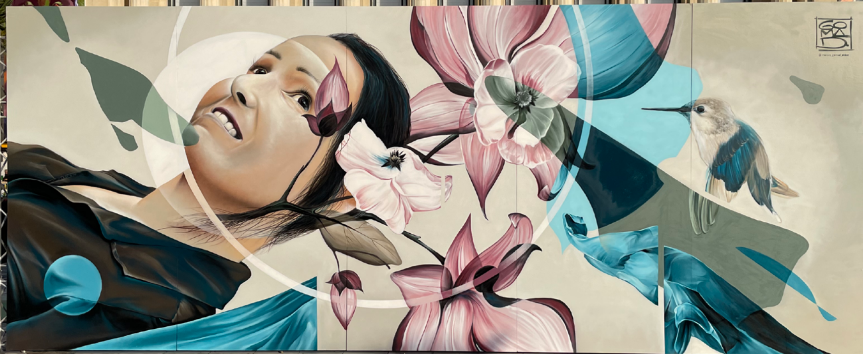
Title: Fancy Nancy Technique: Spray paint on wood For: Graffiti Art festival Size: 8x3 m Location: Puteaux-Paris | France Year: 2021