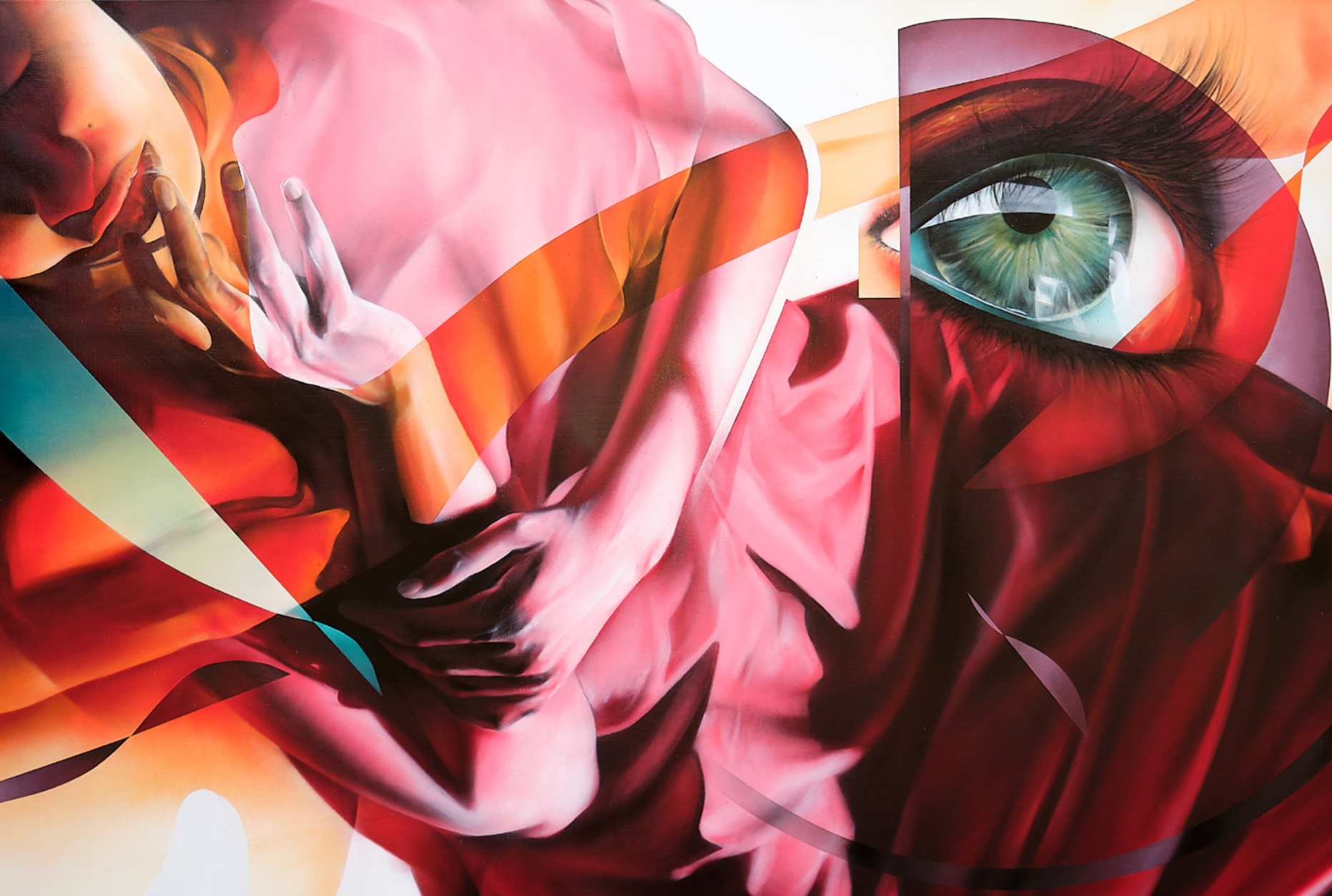
Title: Eye-pleasing (sold) Technique: Spray paint on linnen Size: 2x1,5 m Location: Zuyderland hospital Heerlen | Netherlands Year: 2021