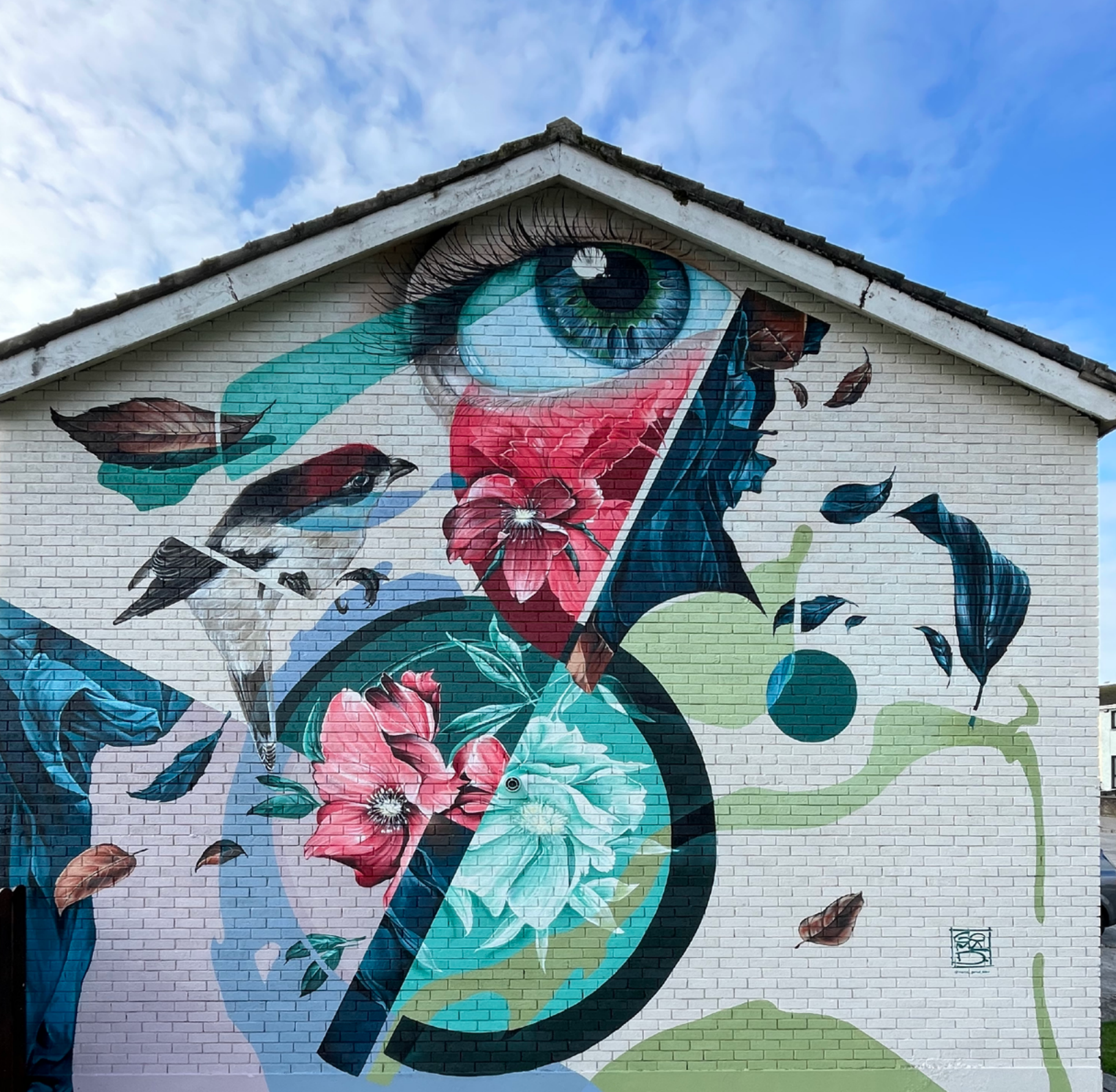
Title: Máthair-nádúr Technique: Spray paint on wall For: Waterford Walls festival Size: 8x9 m Location: Waterford | Ireland Year: 2021