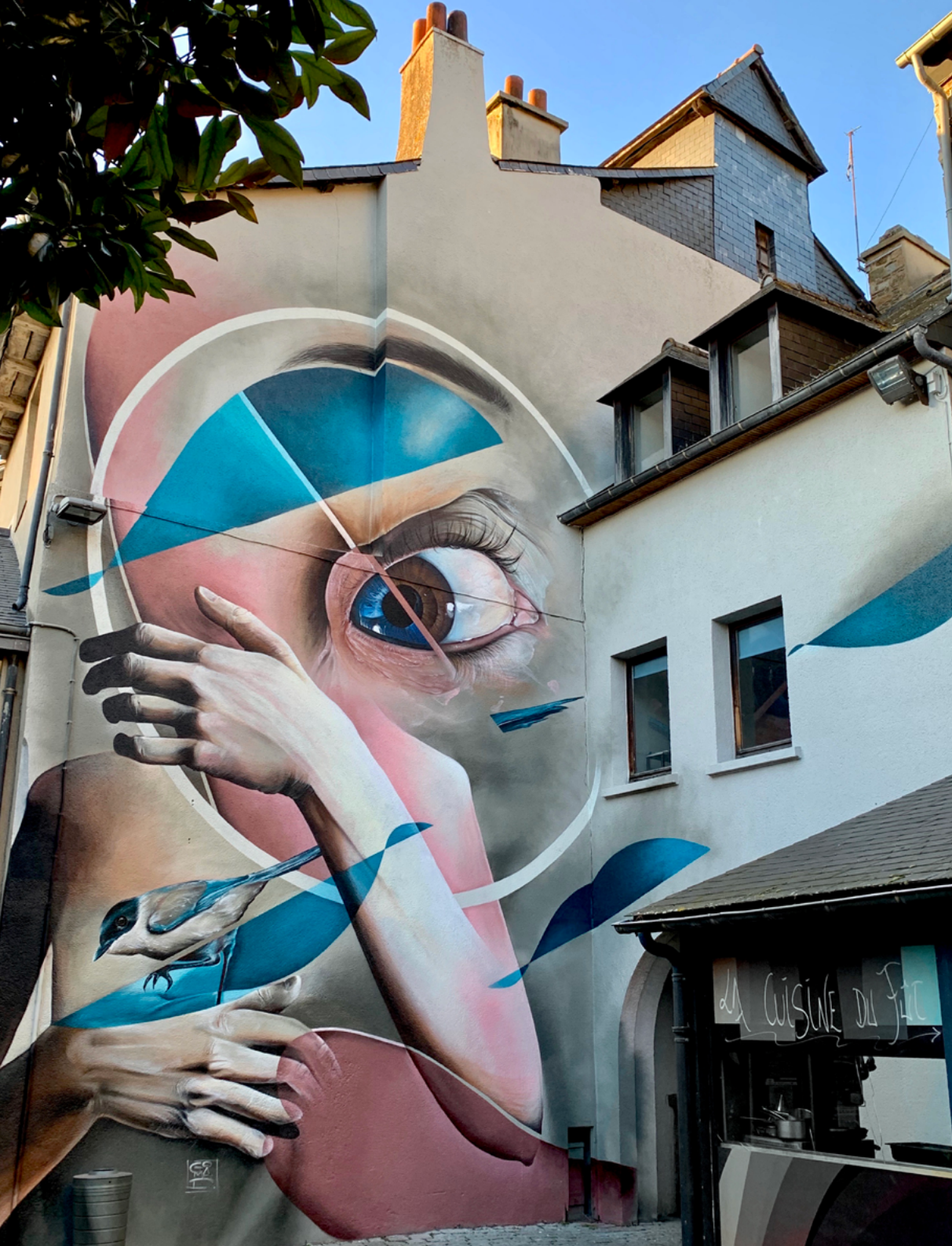
Title: Mère Nature pt1 Technique: Spray paint and acrylics on wall For: Just do Paint Festival Size: 10x5 m Location: Saint-Brieuc | France Year: 2020