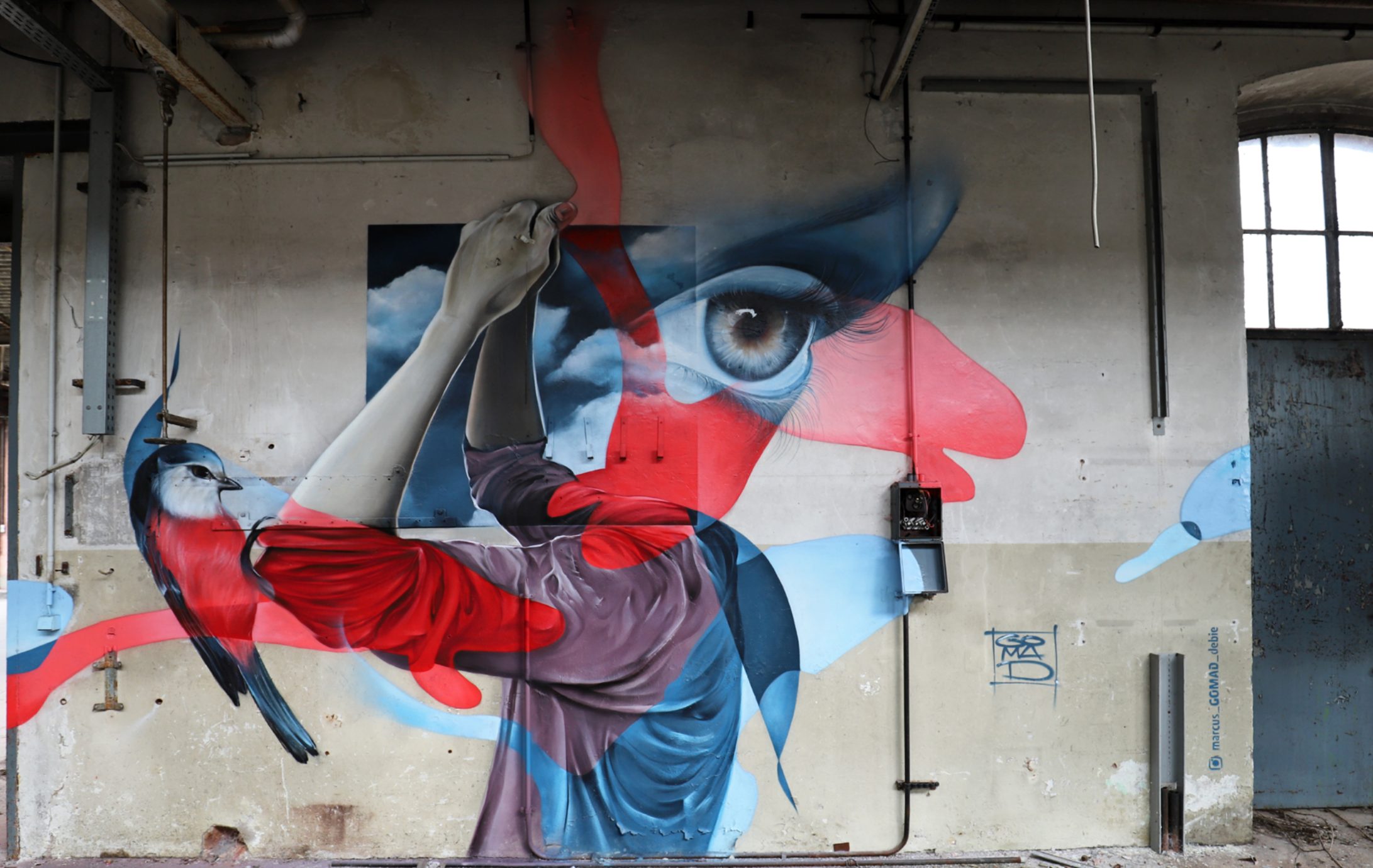
Title: Mirror to your Soul Technique: Spray paint on wall Size: 4x4 m Location: Kaiserslautern | Germany Year: 2019