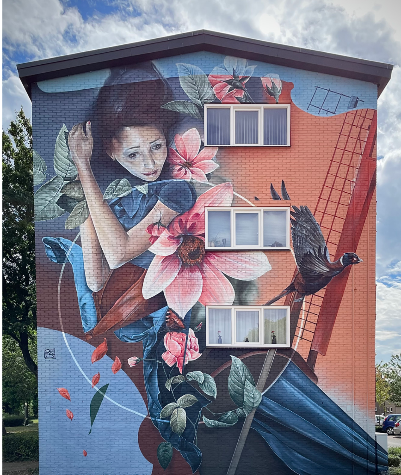
Title: Moeder Natuur pt2 Technique: Spray paint on wall Size: 10x12 m Location: Panningen | Netherlands Year: 2022