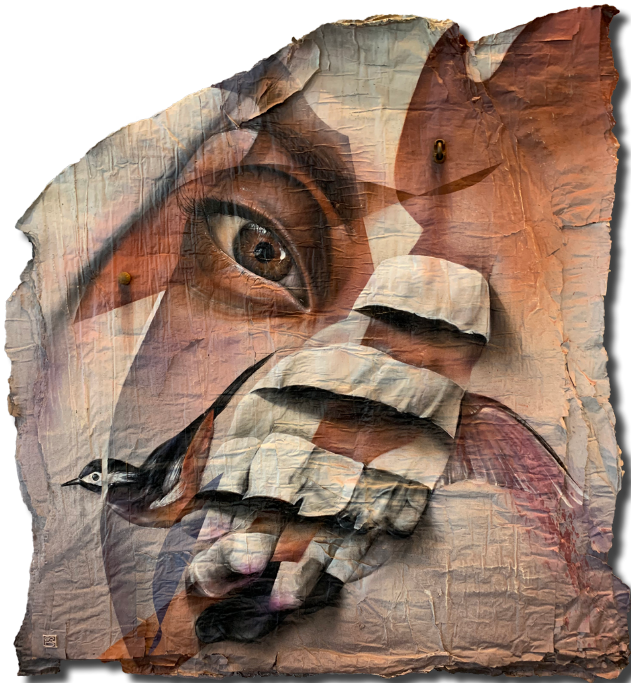
Title: By eye and hand (sold) Technique: Mixed media Size: 95x95 cm Year: 2020