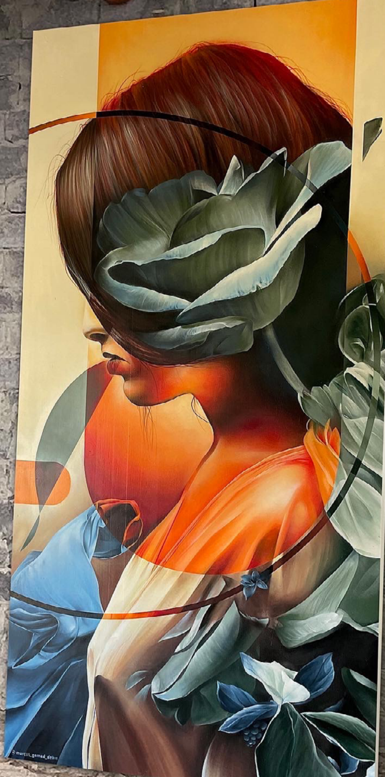
Title: La donna e la rosa Technique: Spray paint on wood Size: 2x4 m Location: Cicerale | Italy Year: 2021