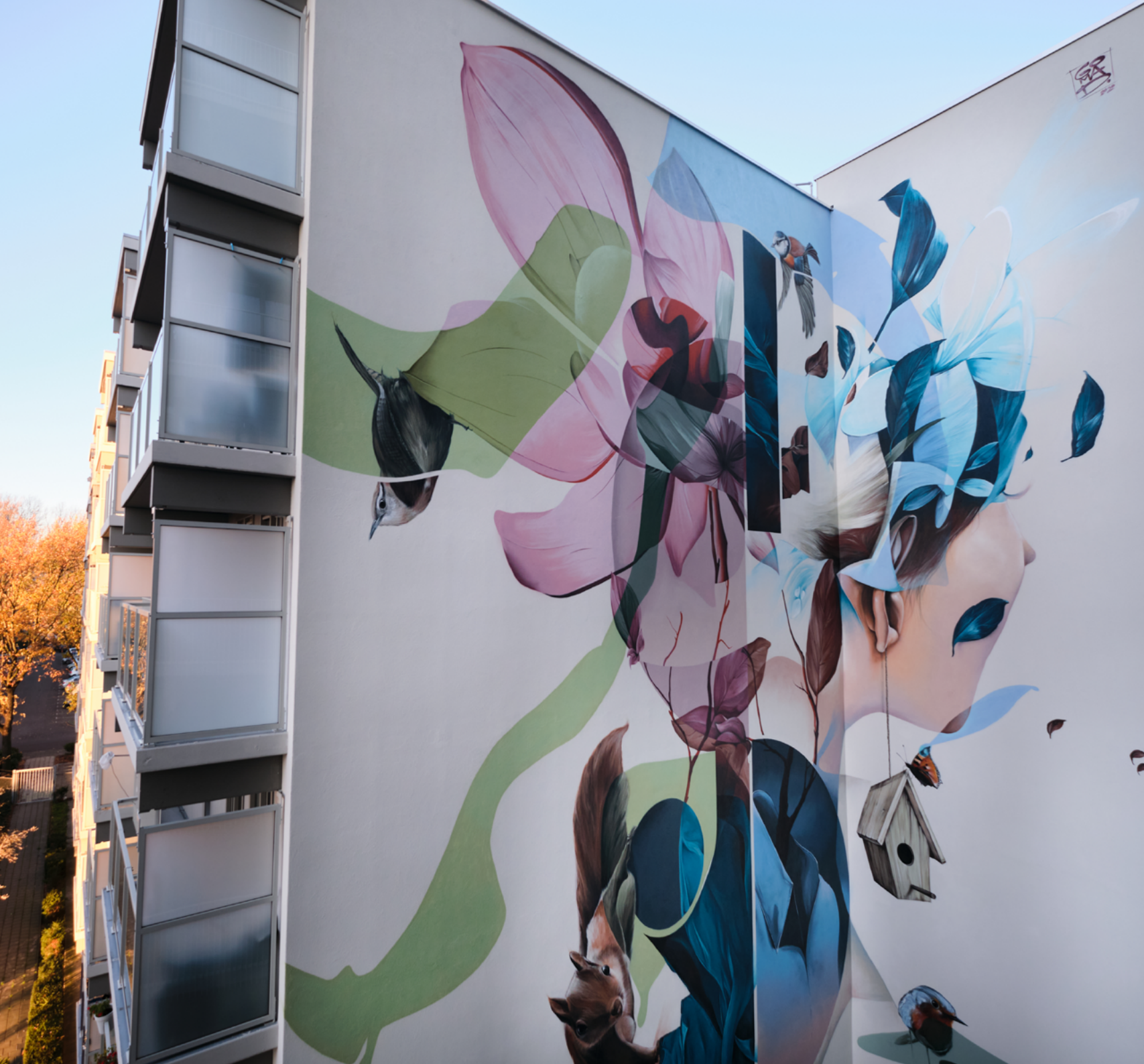
Title: Hidden Jewel Technique: Spray paint on wall Size: 18x16 m Location: Geleen | Netherlands Year: 2020