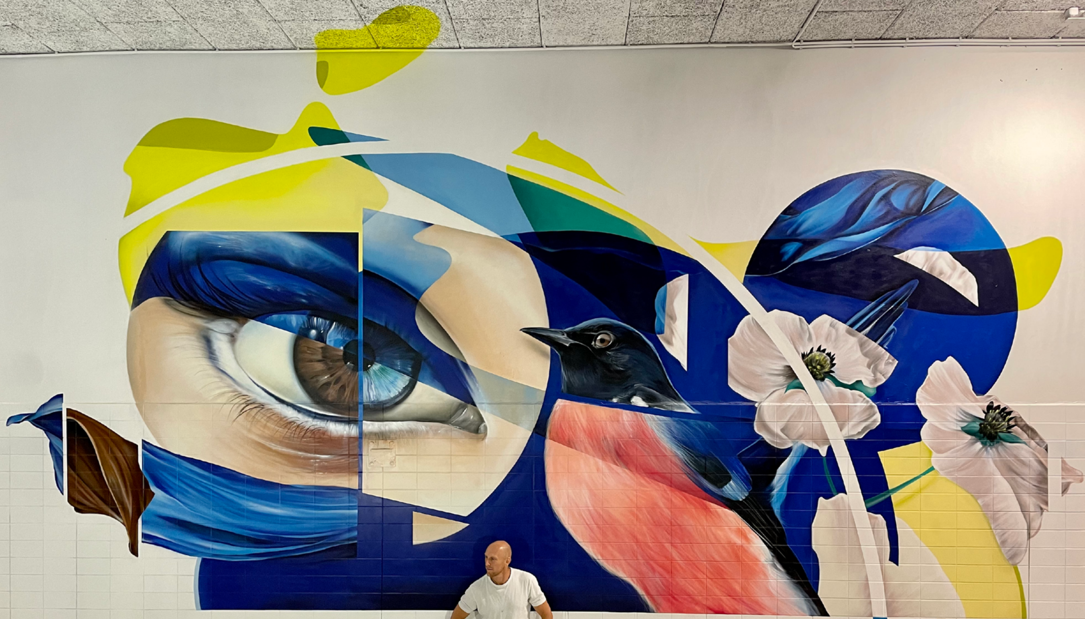
Title: Animal planet Technique: Spray paint on wall For: Wrriter's Block festival Size: 10x5 m Location: Emmen | Netherlands Year: 2021