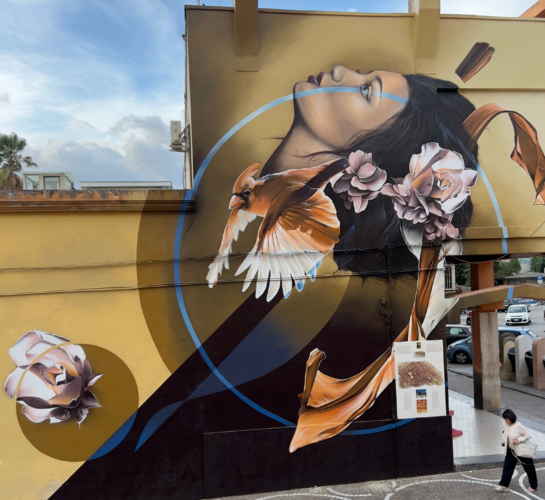
Title: Guarda il cielo minaccioso Technique: Spray paint on wall For: Pompei Street festival Size: 8x8 m Location: Pompei | Italy Year: 2022