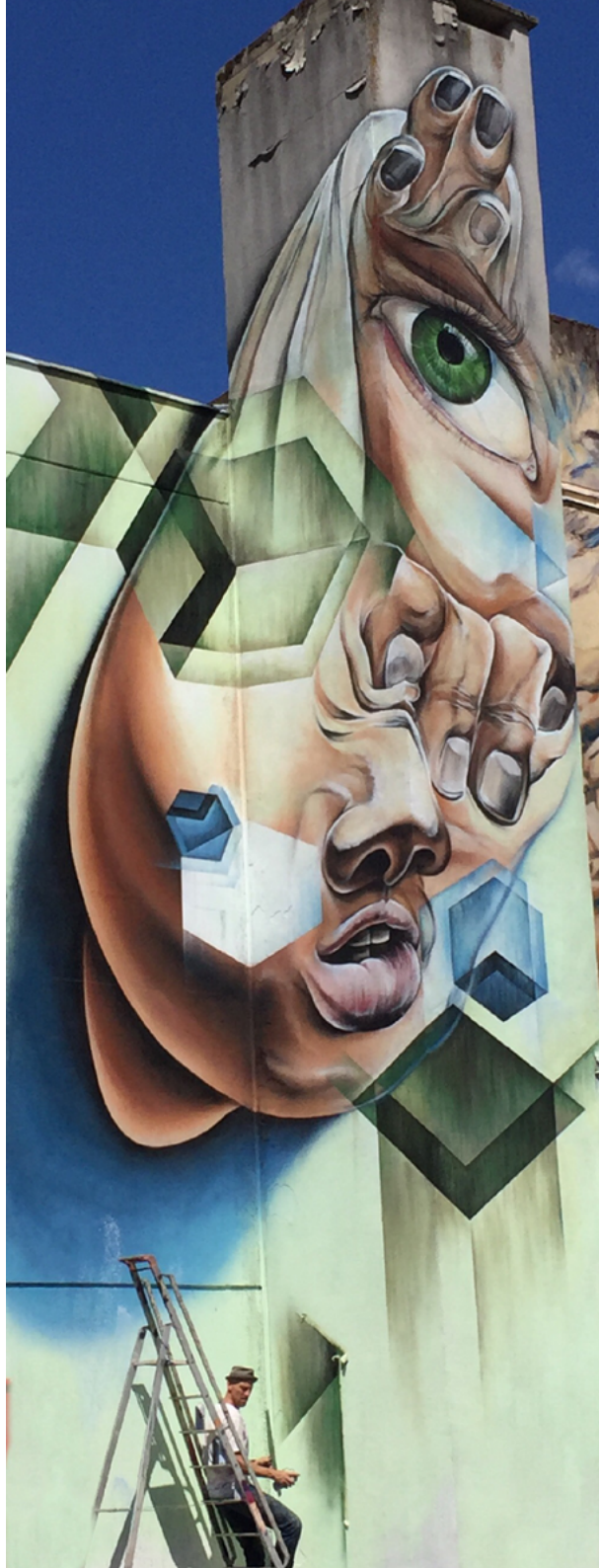
Title: L'oeil surveillant (the overseeing eye) Technique: Spray paint on wall Location: Lurcy-Lévis | France Size: 12x6 meters Year: 2018