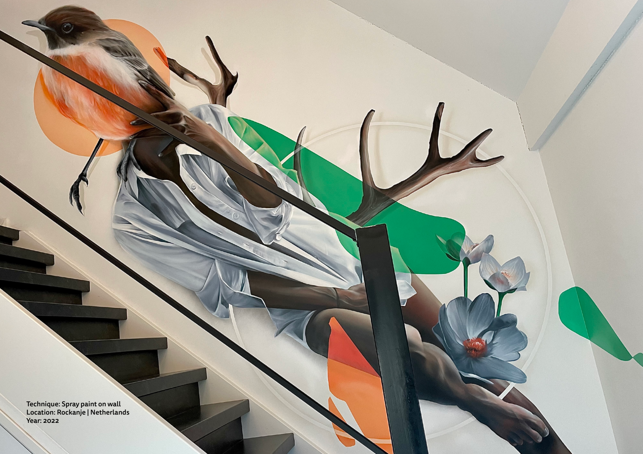
Technique: Spray paint on wall Location: Rockanje | Netherlands Year: 2022