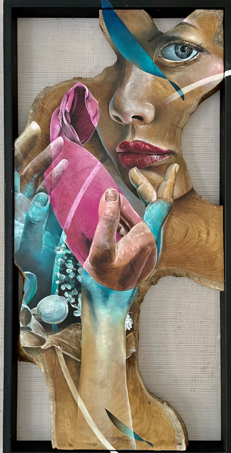
Title: Adoration affectueuse Technique: Oil paint on wood Size: 40x80 cm Location: Bordeaux | France Year: 2022