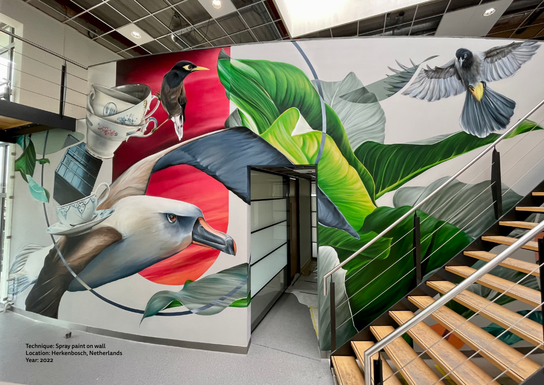
Technique: Spray paint on wall Location: Herkenbosch, Netherlands Year: 2022