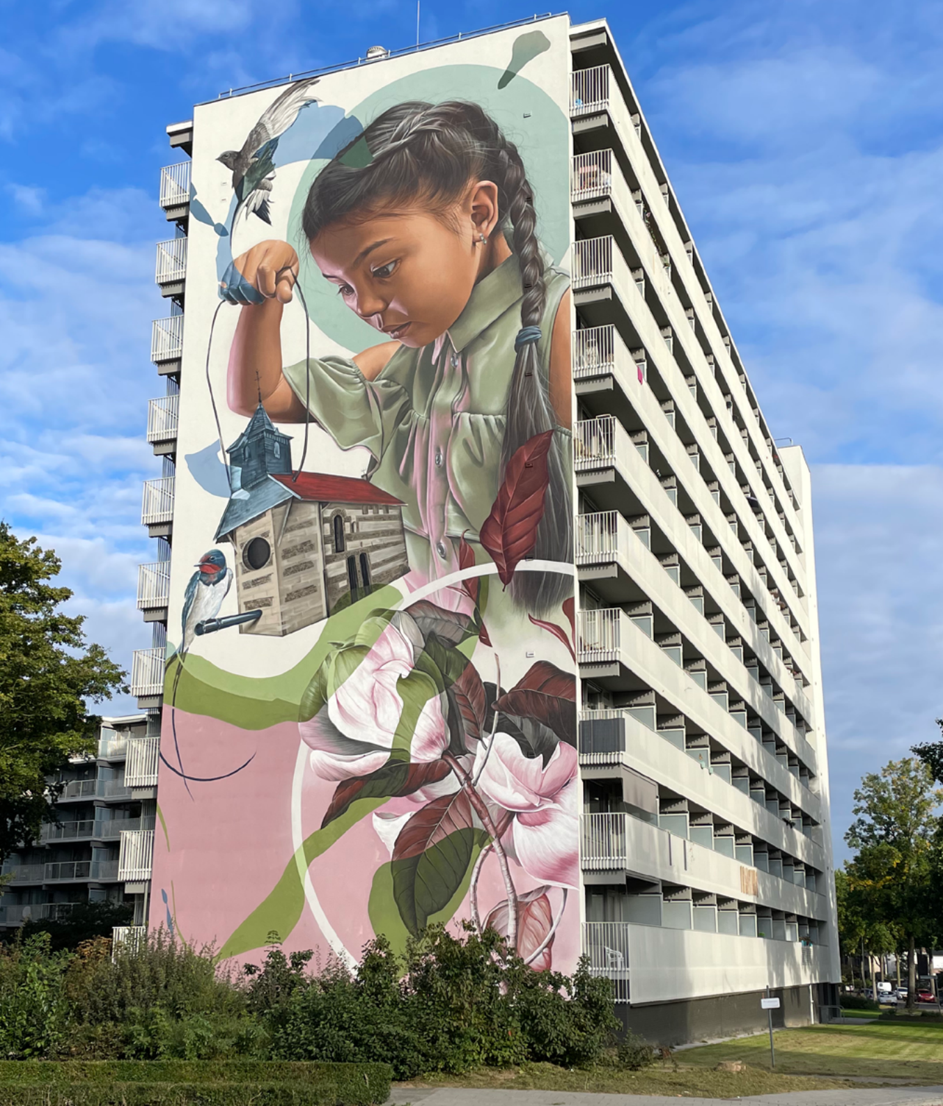
Title: Sayuri Technique: Spray paint and acrylic on wall Size: 30x13 m Location: Geleen | Netherlands Year: 2020