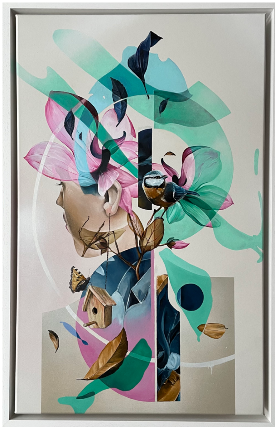
Title: Moder Natur Technique: Oil paint on canvas Size: 50x80 cm Location: Lausanne | Switzerland Year: 2022