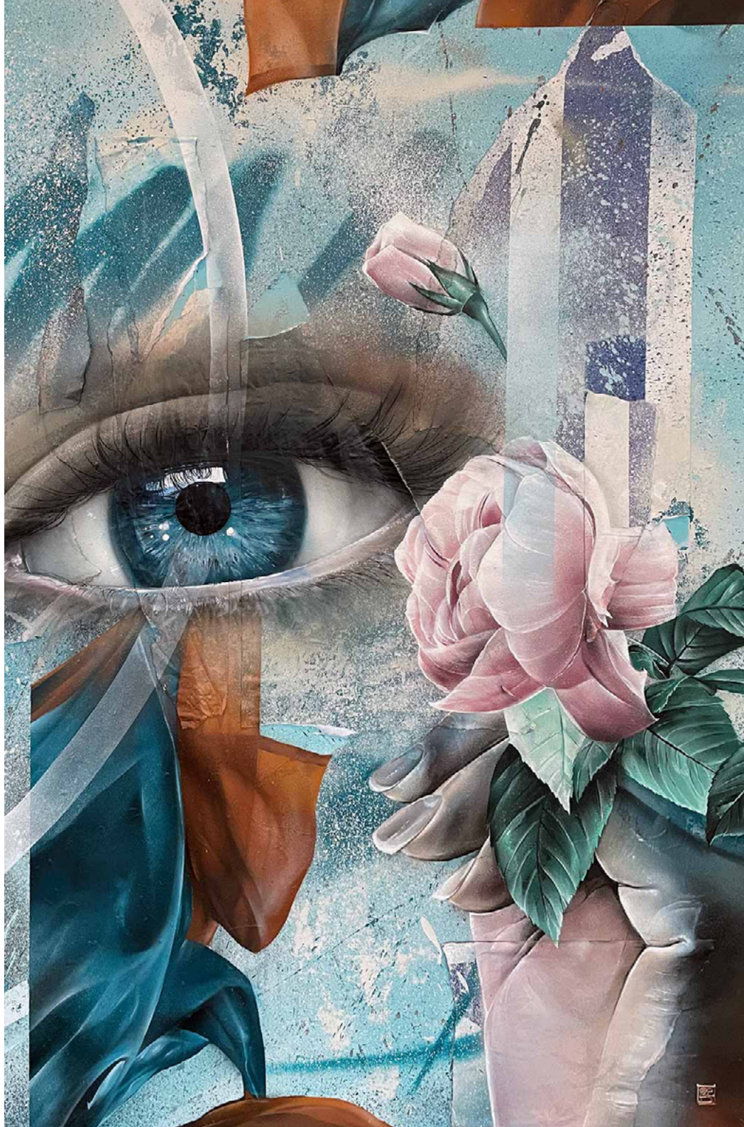
Title: The eye is the jewel of the body (sold) Size: 75×115 cm Year: 2021