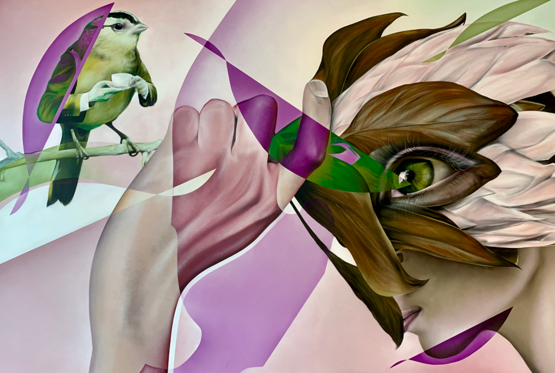
Title: Birdler's view (sold) Technique: Spray paint on linnen Size: 3x2 m Location: Zuyderland hospital Heerlen | Netherlands Year: 2020