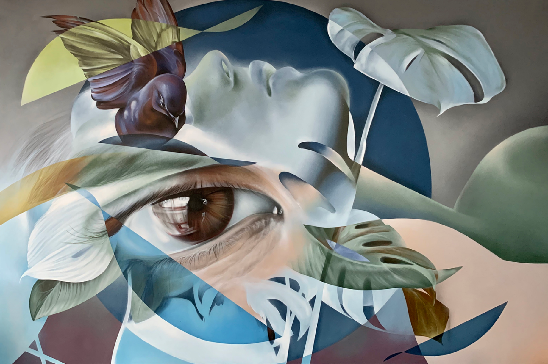
Title: Eyedentity (sold) Technique: Spray paint on linnen Size: 3x2 m Location: Zuyderland hospital Heerlen | Netherlands Year: 2020