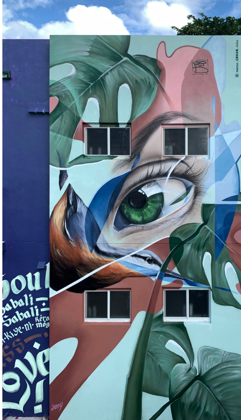
Title: A bird's view pt 2 Technique: Spray paint on wall Size: 4x8 m Location: Miami | USA Year: 2019