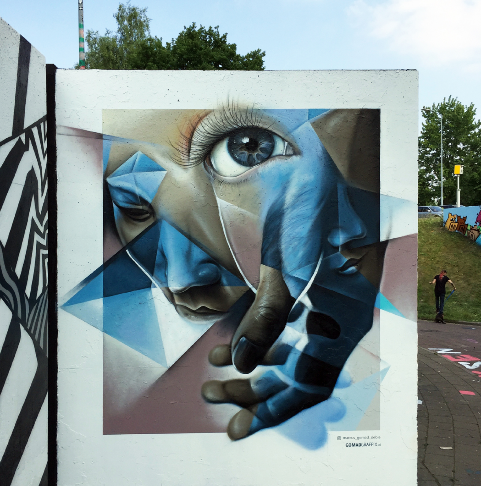
Title: Eyecatcher Technique: Spray paint on wall Location: Eindhoven | Netherlands Size: 3x4 meters Year: 2017