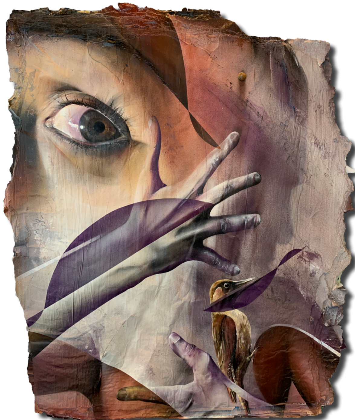
Title: A woman's eyes cut deeper than a knife Technique: Mixed media Size: 85x105 cm Year: 2020