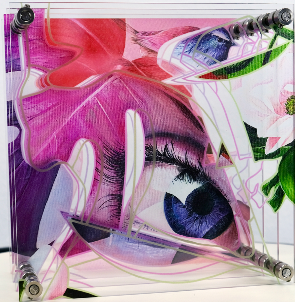
Title: Glance (sold) Technique: Digitalized oil painting on plexiglass Also available as NFT Size: 40x40 cm Year: 2020