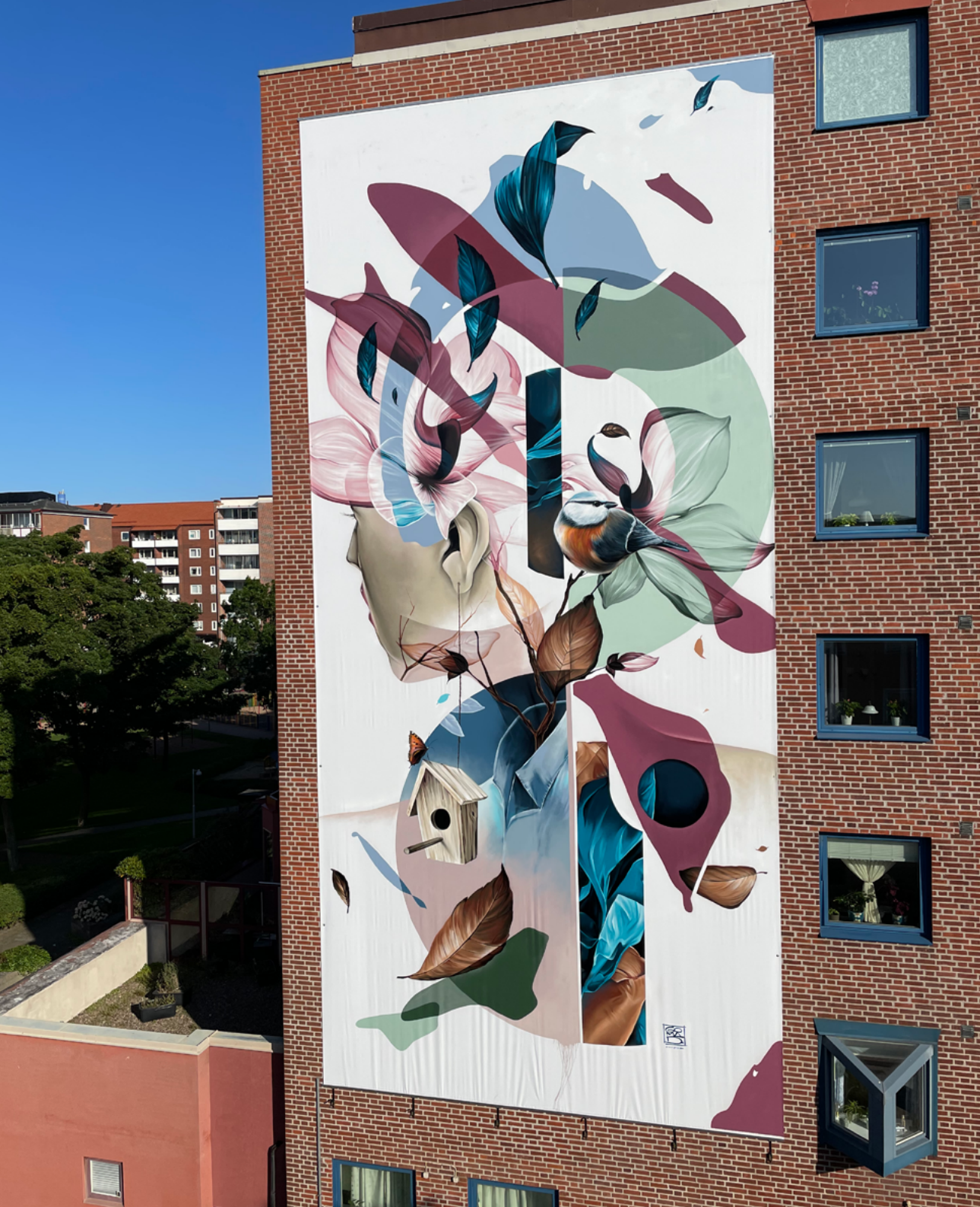
Title: Moder Natur Technique: Spray paint on pvc canvas For: POW! WOW! Sweden Size: 15x7 m Location: Helsingborg, Sweden Year: 2021