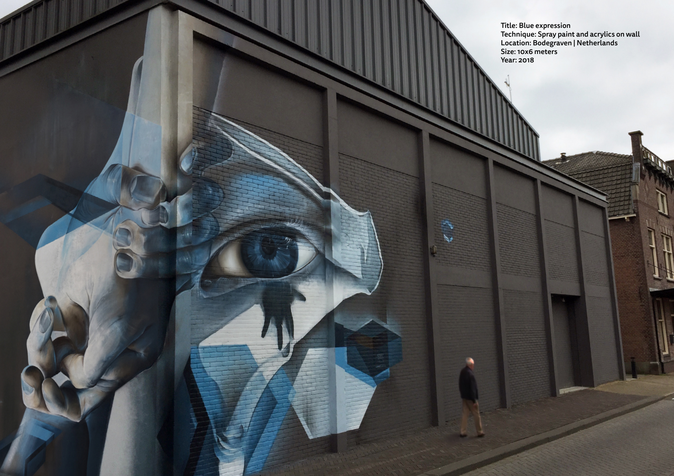
Title: Blue expression Technique: Spray paint and acrylics on wall Location: Bodegraven | Netherlands Size: 10x6 meters Year: 2018