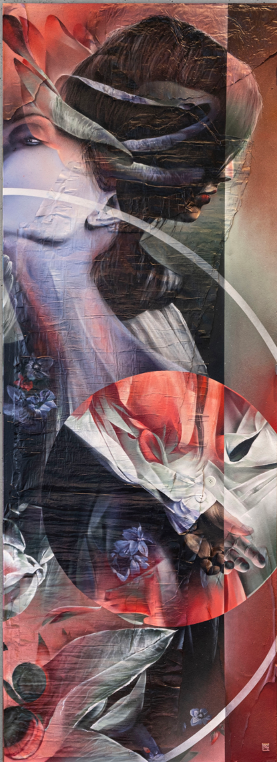
Title: Double vie mystérieuse Technique: Spray paint on wood Size: 1x2 m Location: Saint-Riquier | France Year: 2022