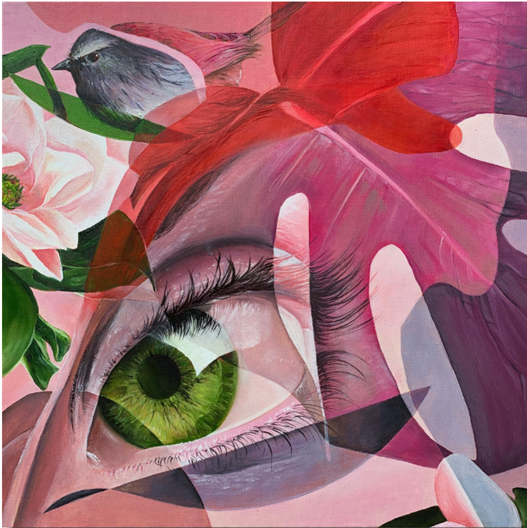
Title: Glance (sold) Technique: Oil painting on linen Size: 40×40 cm Year: 2019